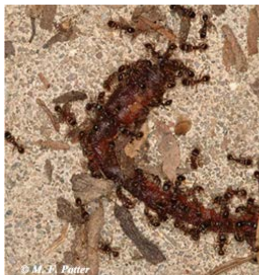
Fig. 1: Worker ants forage for food & nourish the rest of the colony.