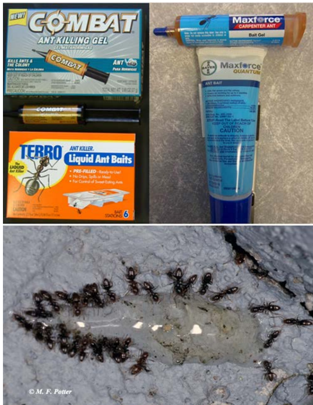
Fig. 3: Baits are convenient and often effective.

versatile and effective. Popular consumer brands include Combat, Raid, Ortho, and Terro. Highly effective professional ant baits sold online include Maxforce FC, Maxforce Quantum, Advion, Optigard, or Alpine. Active ingredients in such baits include fipronil, imidacloprid, indoxacarb, thiamethoxam, and dinotefuran.