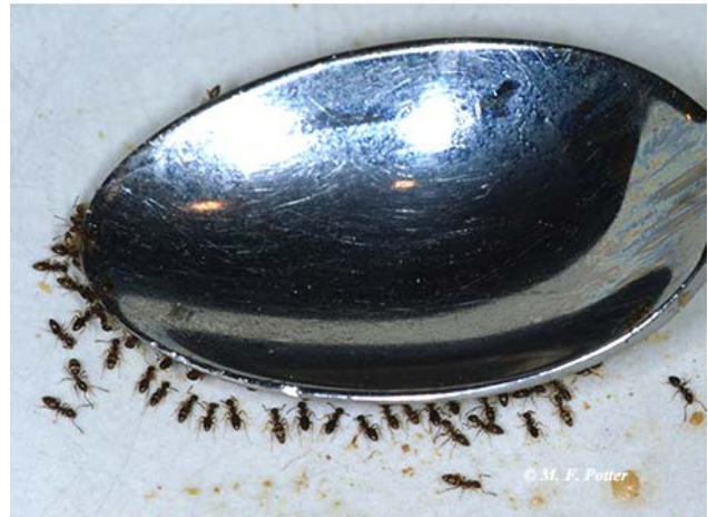
Fig. 8: Ants foraging indoors often originate from outside the building.

This ant can be difficult to control, especially for householders. The better consumer baits to try are syrupy, sweet ones such as Combat Ant Killing Gel or Terro Ant Killer II. Effective professional use gel baits sold online include Maxforce FC, Maxforce Quantum, Advion, Optigard, or Alpine.