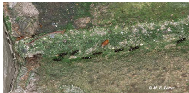
Fig. 4: Ants often follow lines and edges.

Ants Nesting Outdoors. Ants noticed indoors are often originating outside. Try to trace the ants spotted inside back to the point where they are entering from outdoors. This may be beneath an entrance door, along a window sill, or where exterior siding meets the foundation wall. Ants usually prefer to trail along lines and edges. When tracing ant trails indoors or outdoors, pay attention to cracks, seams, and edges created by baseboards, the tack strip beneath perimeter edges of carpeting, mortar joints, the foundation-siding interface, etc. Nests sometimes will be located in the ground, marked by a mound or anthill; other times, the colony or colonies will be concealed under mulch, gravel, stones, landscaping timbers, pavement, or beneath the grass edge abutting the foundation of the building. Some kinds of ants prefer to nest behind exterior siding or wood trim that has been damaged by moisture. While it takes a bit more time to locate where ants are entering from outdoors, results will be more rapid and permanent than if you only treat ants which have already entered. One way to entice ants to reveal the location of their hidden trails and nests (outdoors or indoors), is to place small dabs of honey or jelly on an index card, etc., next to where ants are observed. After the ants have fed, they will head back to the nest.