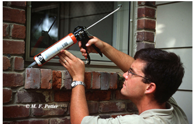
Fig. 6: Sealing entry points can help reduce entry of ants & other pests.

Ant entry into homes can be reduced by sealing around door thresholds, windows, and openings where utility pipes and wires enter buildings. Entry can likewise be reduced by spraying one of the aforementioned liquid insecticides around the outside perimeter of the building. Depending on product and label directions, this may entail spraying a one to six-foot swath along the ground adjacent to the foundation, and one to three feet up the foundation wall. Pay particular attention to ant trails and points of entry into the home, such as around doors and where utility pipes and wires enter from outside.