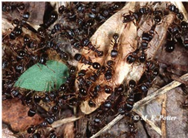
Fig. 5: Mulch is a common nesting site for ants.

When a below-ground nest is discovered, the colony often can be eliminated by spraying or drenching the nest location with a liquid insecticide. Effective ingredients (e.g., bifenthrin, cyfluthrin, deltamethrin, lambda cyhalothrin) are usually found in products sold to control ants, cockroaches, spiders, and other crawling insects. Large colonies may require greater amounts of liquid to move the insecticide throughout the network of underground galleries within the nest (using a bucket to apply the diluted insecticide concentrate is an effective method). Follow label directions for treating ant mounds, paying attention to precautions for mixing and application. Another effective and convenient way to control some species of outdoor nesting ants is with a granular bait such as Combat, Maxforce, Advance, Advion or InVict. Sprinkle the bait in small amounts beside outdoor ant mounds, along pavement cracks, and other areas where ants are nesting or trailing.