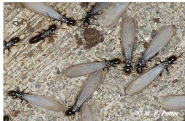
Fig. 2a: Winged ants (above) versus winged termites (below).