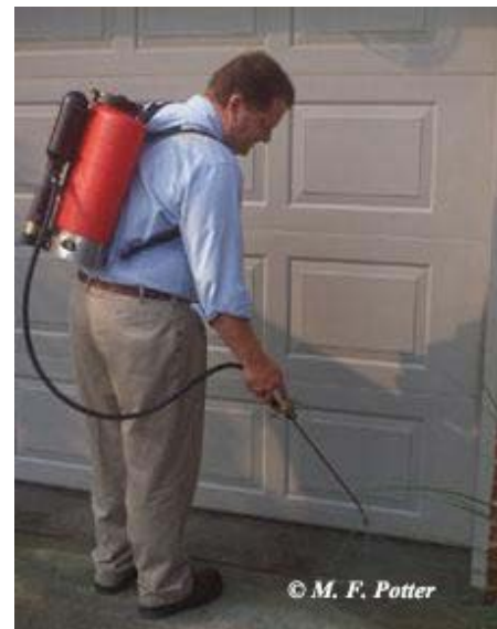
Fig. 7: Insecticides applied around doors and exterior openings can help reduce pest entry.

In Kentucky and much of the Midwest, spraying or applying granular insecticides to the entire yard is not recommended, and will seldom, if ever, solve an ant infestation indoors. Whole-yard treatments also eliminate beneficial ants, which help to