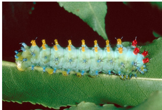
Figure 2. Cecropia moth caterpillar.

The caterpillars take most of the summer to mature and are up to four inches long when fully developed. They are bluish green, and along the back there is a pair of yellow projections on each body segment. The first three pairs of tubercles are more conspicuous and are in the form of yellow balls with black spines. The cecropia caterpillars feed mainly on cherry, plum, apple, elderberry, box elder, maple, birch and willow, but will also feed on linden, elm, sassafras and lilac.