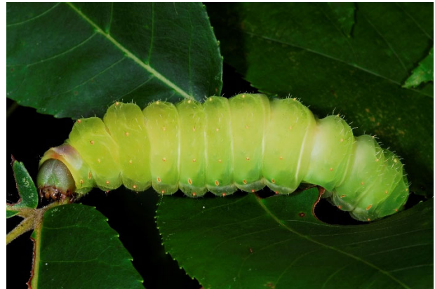
Figure 8. Luna moth caterpillar.

walnut and persimmon, but has also been collected from sassafras, willow, oak, beech, plum and iron wood. The cocoon is spun among the leaves of the host and falls to the ground when the tree's leaves are shed. The adult moths emerge in June to lay eggs.