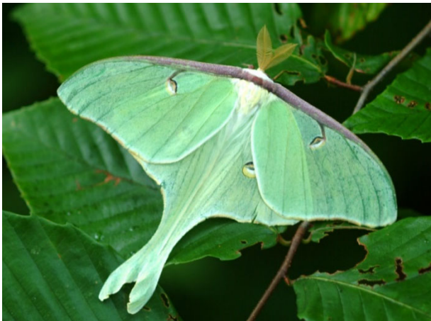
Figure 7. Luna moth.

This large pale green, swallow-tailed moth with a clear window eyespot in the front and hind wings makes this one of the most beautiful saturniid moths, much prized by amateur collectors. The wing span is about four inches.