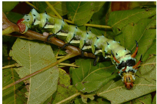
Figure 13. Hickory horned devil.

They are the largest of the silk moth caterpillars and commonly grow to five inches. The long barbed horns on the forward end of the body makes the caterpillar look intimidating but it is entirely harmless to humans.