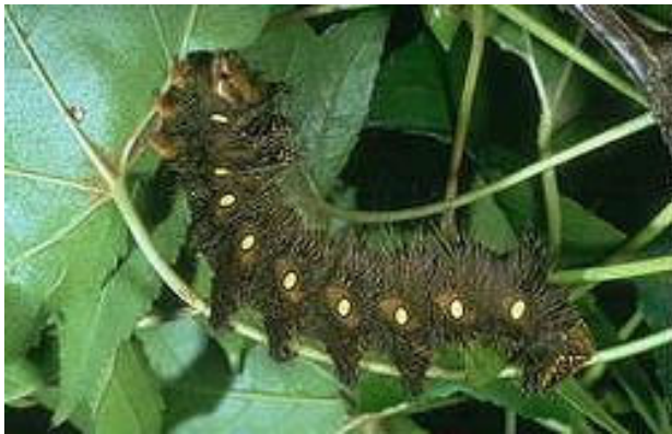
Figure 15. Imperial moth caterpillar.

Fully developed caterpillars are three to four inches long and thinly clothed with long hairs. The barbed horns near the front of the body are much shorter than those of the hickory horned devil.