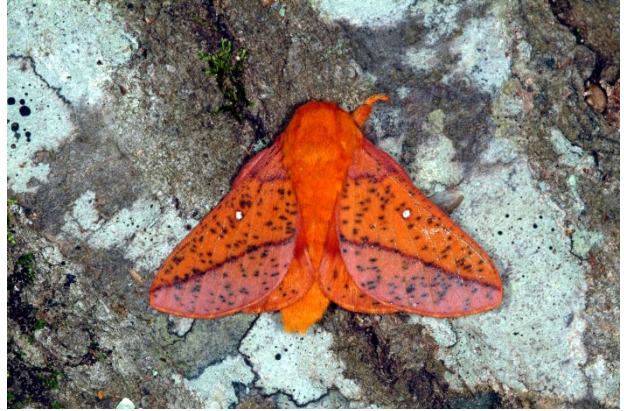
Figure 19. Spiny oakworm moth.

In the moth stage this resembles the orange-striped oakworm, but is more densely flecked with dark spots. The orange-striped species is more prevalent to our north. The spiny oak worm seems to be more common in Kentucky.