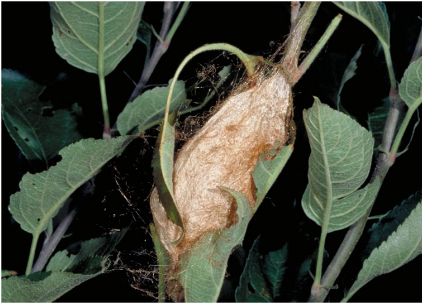
Figure 3. Cecropia moth cocoon.

In early fall the mature caterpillar spins a spindle-shaped cocoon which is about three inches long. The cocoon is attached along its full length to a twig on the host tree. Inside the cocoon the caterpillar changes to a pupa, the life stage in which it spends the winter.