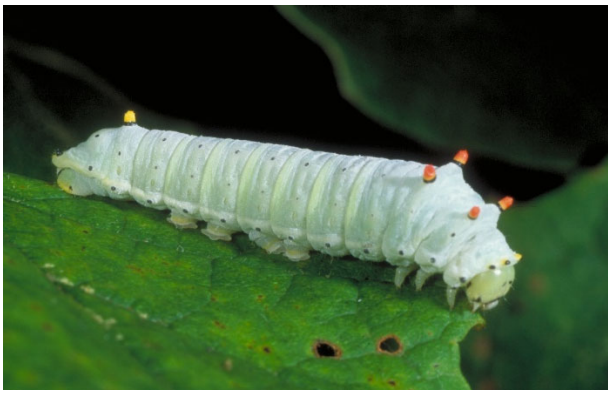
Figure 6. Promethea moth caterpillar

Tulip trees seem to be a favorite host plant but they will also feed on ash, azalea, bayberry, barberry, birch, button bush, cherry, lilac, plum, poplar, sassafras, spice bush and sweet gum.