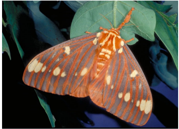
Figure 12. Royal walnut moth.

The caterpillar of this moth is known as the hickory horned devil. These two common names identify the caterpillars' favorite host plant, however they will also feed on sumac, sweet gum, lilac, persimmon, ash and beech.