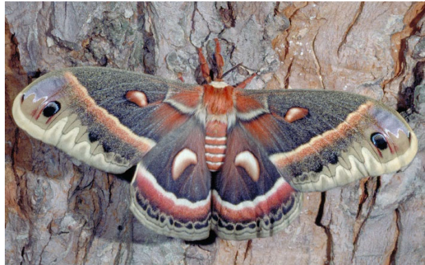
Figure 1. Cecropia moth.

eggs. They are often found at lighted windows at night.