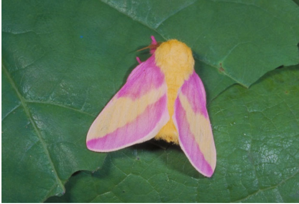
Figure 17. Rosy maple moth.

The male is slightly smaller than the female. The full-grown caterpillar is about 1.5 inches long, pale yellowish-green and striped with alternate pale yellow-green and darker green lines. The head is cherry red. On the second segment behind the head are two long, slender, slightly curved black horns. Short black spines occur along the sides of the body. On the lower side of the body near the rear is a rose-colored area. The preferred food is leaves of silver and red maples but they occasionally feed on box elder and oaks. Large colonies of caterpillars sometimes strip host trees in the mid-west.