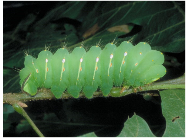
Figure 5. Polyphemus moth caterpillar.

The polyphemus caterpillar prefers oak, hickory, elm, maple and birch but apple, beech, ash, willow, linden, rose, grape and pine are also satisfactory host plants. The caterpillar's color is light green with narrow white bars on the sides.