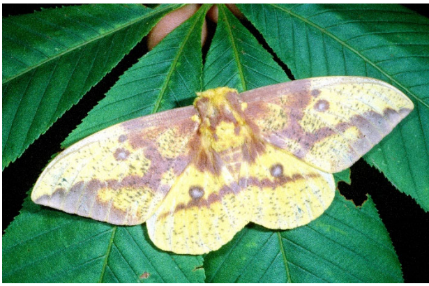
Figure 14. Imperial moth.

Fully developed caterpillars are three to four inches long and thinly clothed with long hairs. The barbed horns near the front of the body are much shorter than those of the hickory horned devil.