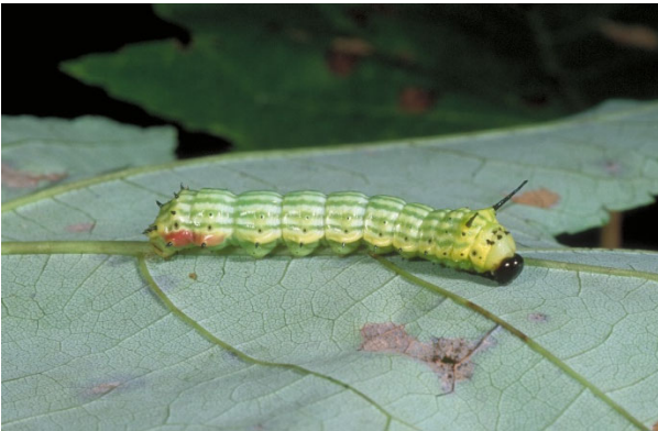
Figure 18. Greenstriped mapleworm.

The male is slightly smaller than the female. The full-grown caterpillar is about 1.5 inches long, pale yellowish-green and striped with alternate pale yellow-green and darker green lines. The head is cherry red. On the second segment behind the head are two long, slender, slightly curved black horns. Short black spines occur along the sides of the body. On the lower side of the body near the rear is a rose-colored area. The preferred food is leaves of silver and red maples but they occasionally feed on box elder and oaks. Large colonies of caterpillars sometimes strip host trees in the mid-west.