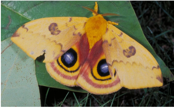
Figure 10. Io moth male.

The caterpillar is overall light green, but along each side there is a narrow lavender line bordered below with a white line. The caterpillars feed on a wide variety of plants including corn, roses, willow, linden, elm, oak, locust, apple, beech, ash, currant and clover.