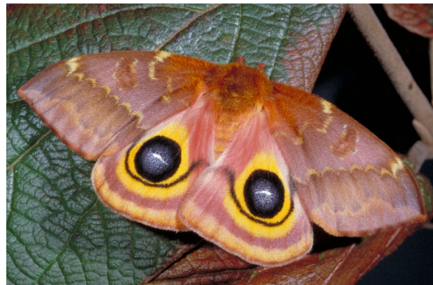
Figure 9. Io moth female.

This is not the smallest of the saturniid moths, but its wing spread of two to three inches is much less than that of average sized moths mentioned so far. The general color is yellowish with a large dark eye spot in the middle of each hind wing. The moths appearing in spring or early summer and can occasionally be found in fall.