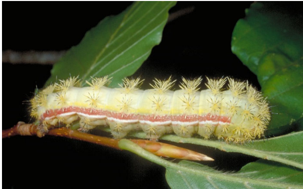
Figure 11. Io moth caterpillar.

The caterpillar is overall light green, but along each side there is a narrow lavender line bordered below with a white line. The caterpillars feed on a wide variety of plants including corn, roses, willow, linden, elm, oak, locust, apple, beech, ash, currant and clover.