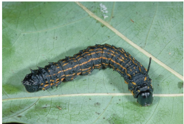
Figure 16. Orangestriped oakworm.

Beginning in June and extending over a period of about a month the moths emerge and lay eggs. Caterpillars of all sizes are found during the summer but they all mature by early fall. Several similar species also occur in Kentucky but they are more distinguishable in the larva stage.